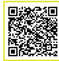
IMPACT REPORT HERE

JA of Western New York and JA Central Upstate New York partnered with the region’s employers as part of JA Inspire Virtual, a unique career exploration learning experience designed for middle and high school students. Aiming to inform students about careers and jobs at their companies during the virtual event, the career fair takes place in a visually rich virtual environment that mimics the dynamics of a live event. Features include a virtual lobby, exhibit halls with booths, a virtual auditorium, and a learning lounge. Within the virtual experience, students attend webinars and presentations; explore career booths, work readiness tools, and resources; and interact with career speakers and industry experts.