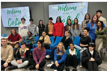
Lockport High School students at The University at Buffalo for an entrepreneurship panel