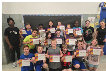
Lockport High School students teaching "JA Our Nation" to fifth-grade students at Emmet Belknap Intermediate School