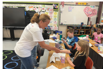
Bank of America volunteer at Union East Elementary, Cheektowaga