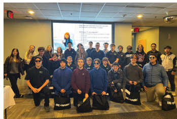
West Seneca High School students job shadow at Ingram Micro