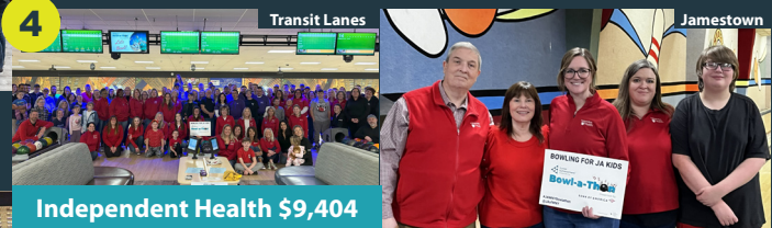
4 Independent Health $9,404