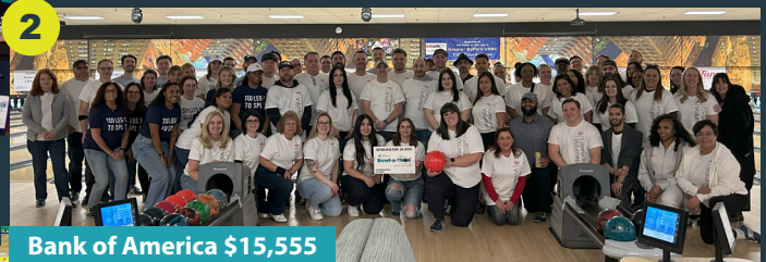
2 Bank of America $15,555