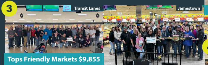
3 Tops Friendly Markets $9,855