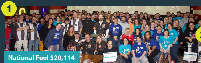
1 National Fuel $20,114