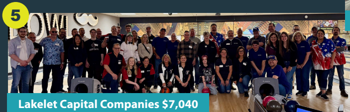
5 Lakelet Capital Companies $7,040